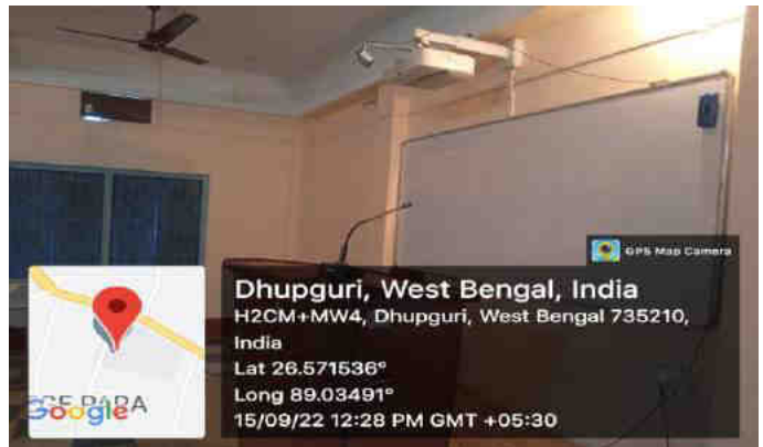
Room No 25