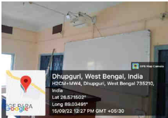
Room No 24