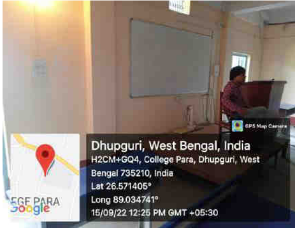
Room No 22