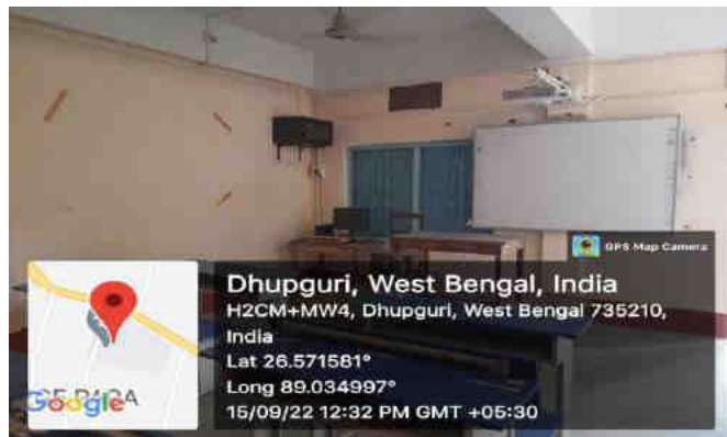
Room No 19