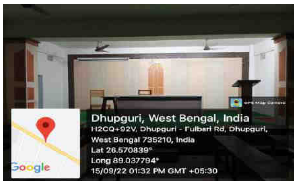
Seminar Hall 2