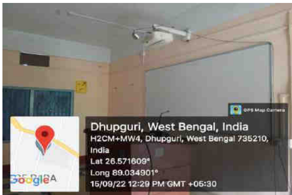
Room No 26