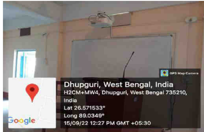
Room No 23