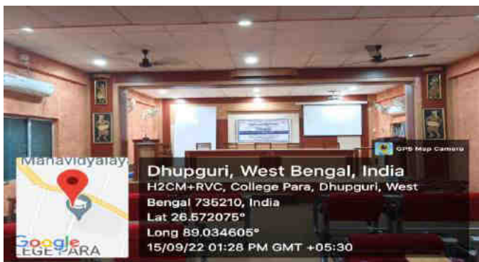
Seminar Hall 1