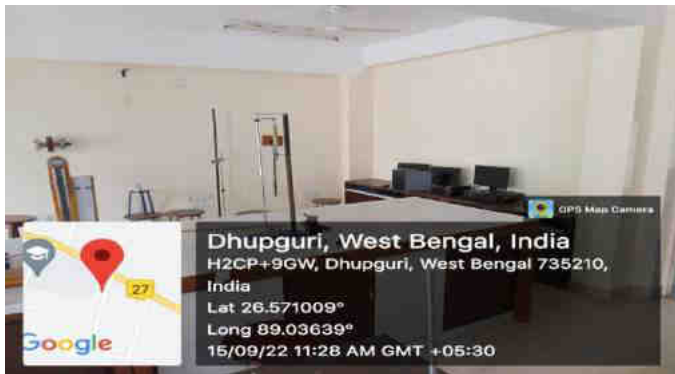
Physics Lab 2