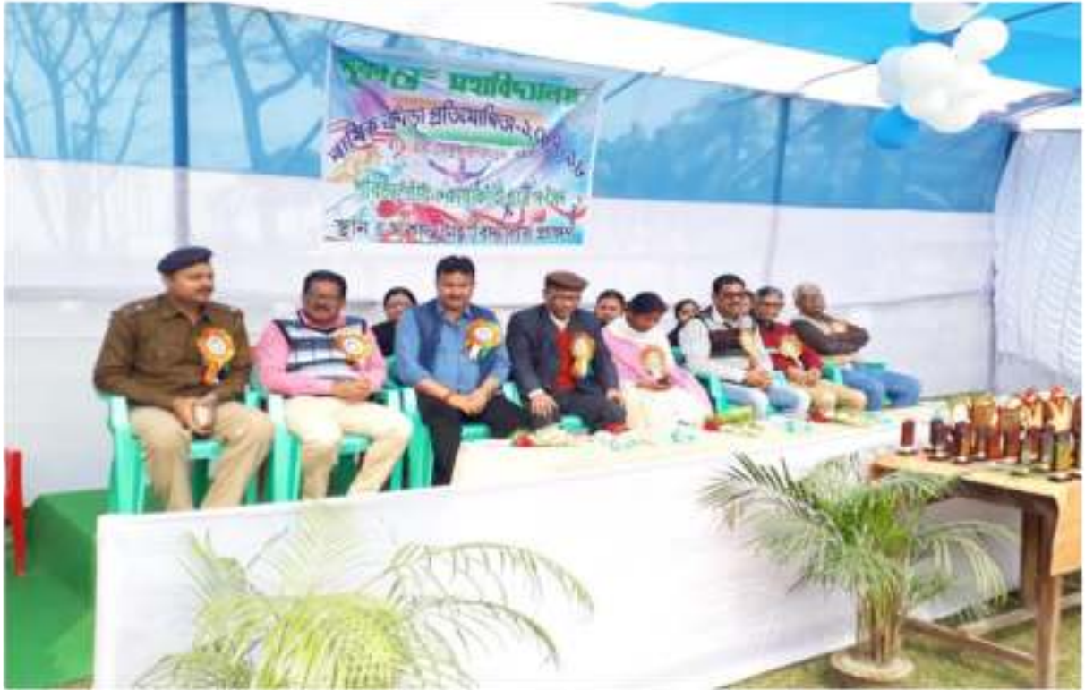
ANNUAL SPORTS 2017- 2018