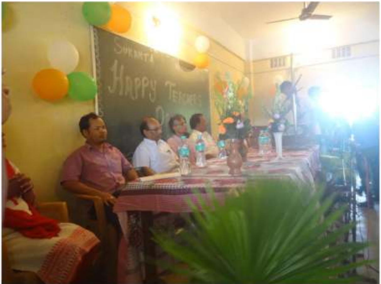
TEACHERS' DAY CELEBRATION