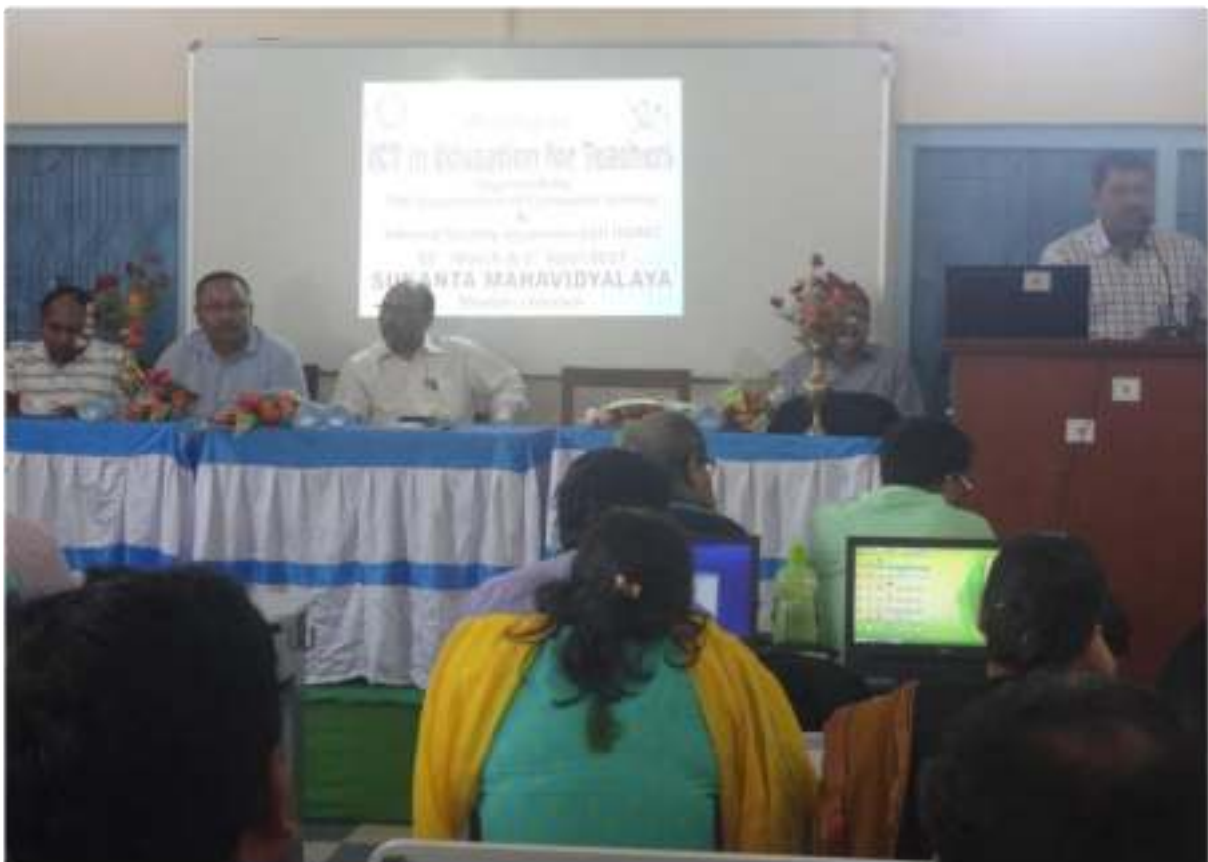
ICT WORKSHOP FOR TEACHERS