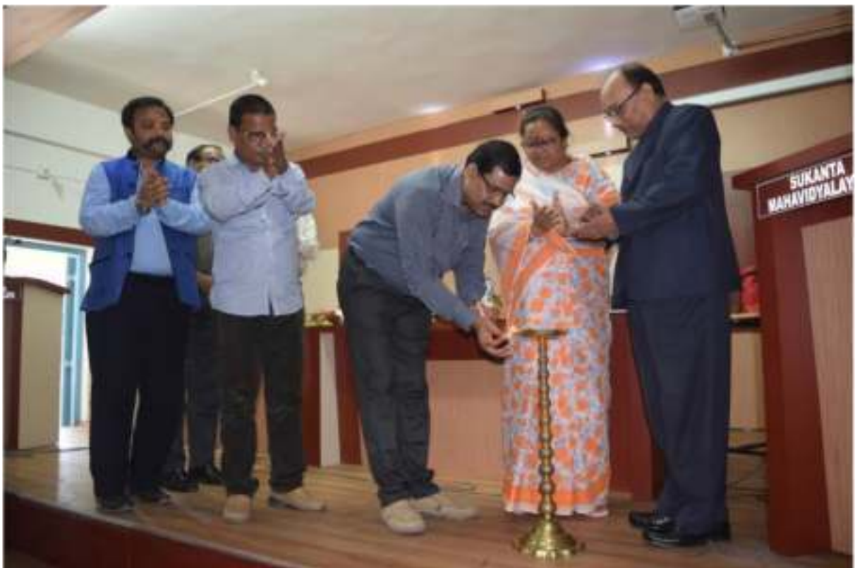
PRESIDENT OF THE COLLEGE