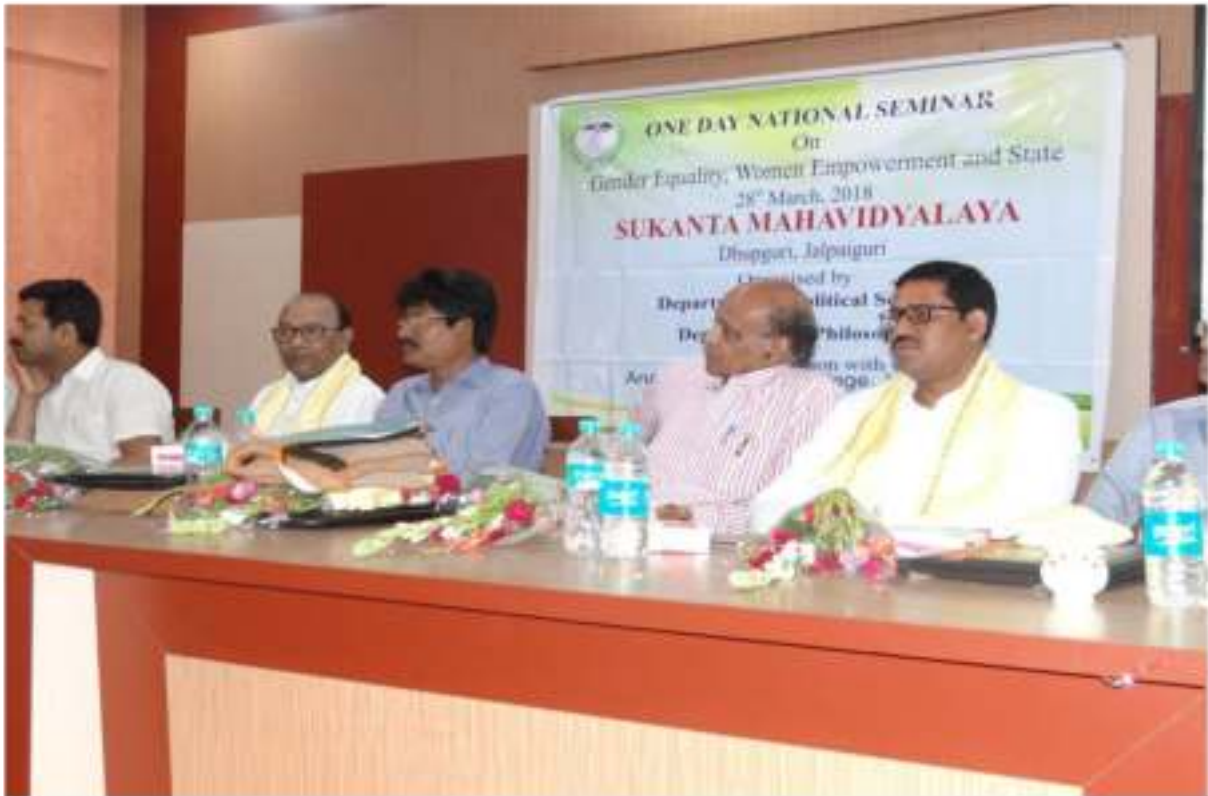
NATIONAL SEMINAR ORGANISED BY THE COLLEGE