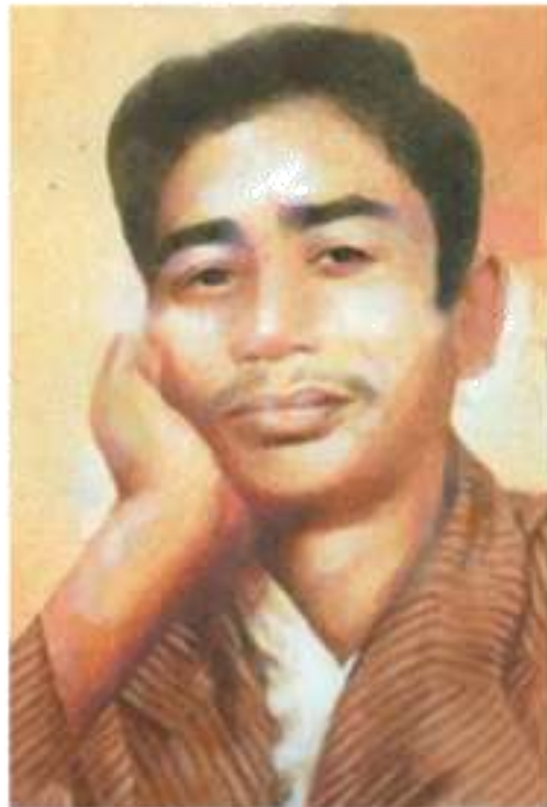
Sukanta Bhattacharyya (1926-1947)