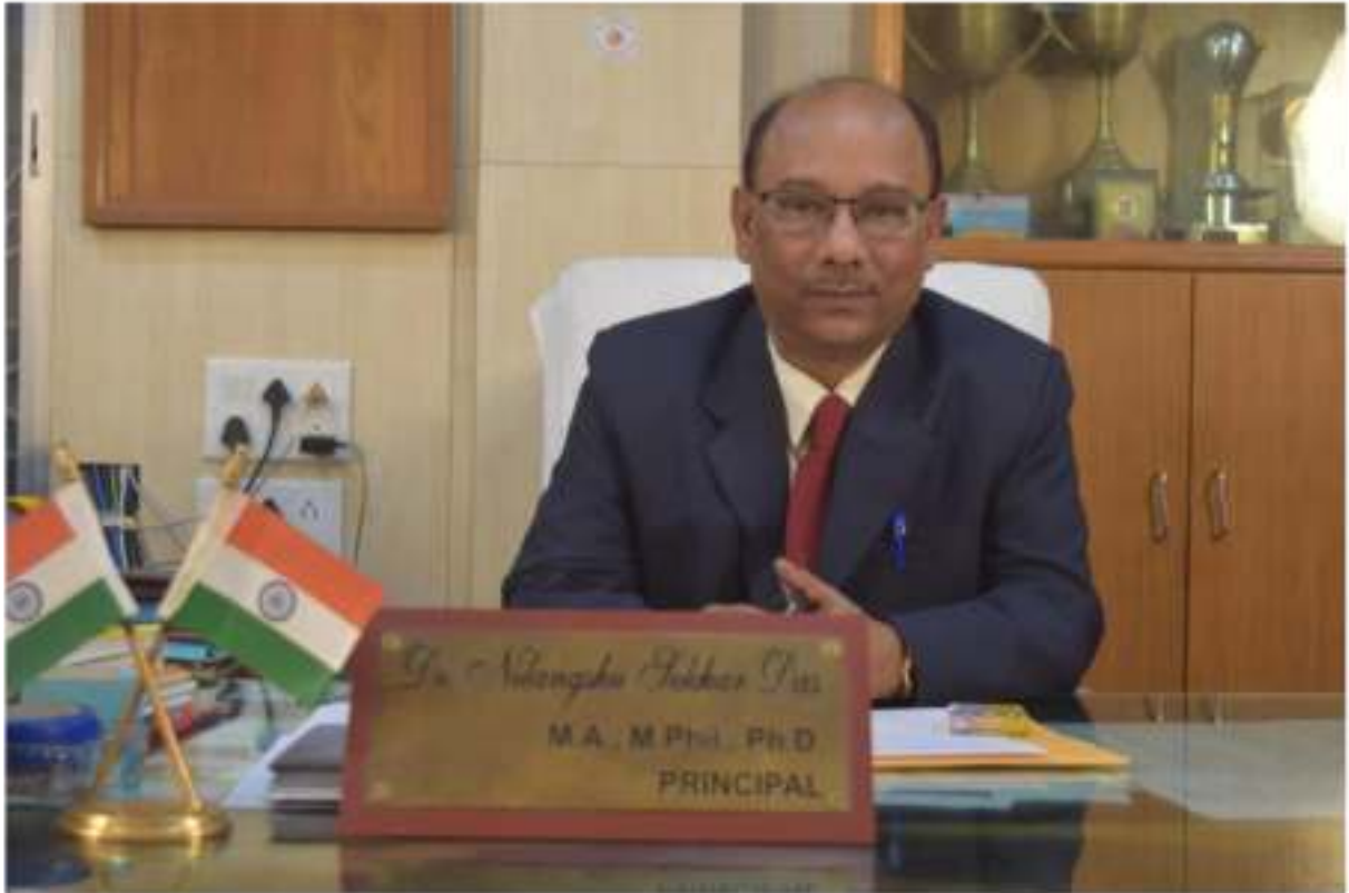
PRINCIPAL OF THE COLLEGE