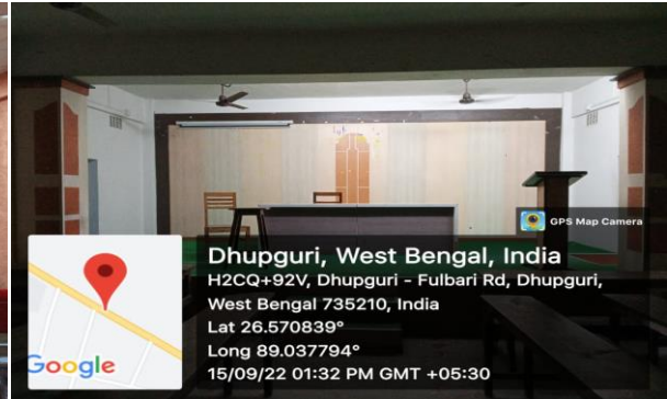
Seminar Hall 2