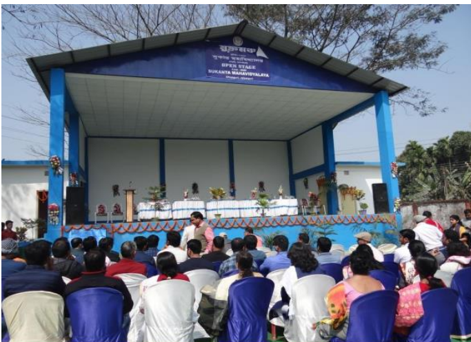
Open stage for Cultural programme