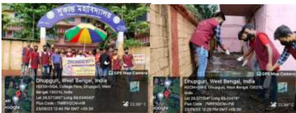
Dangué awareness Programme