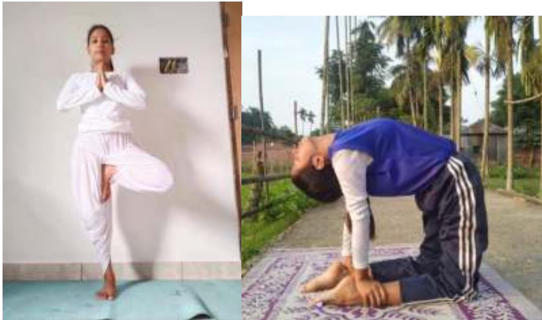
Volunteer performing various form of Yoga