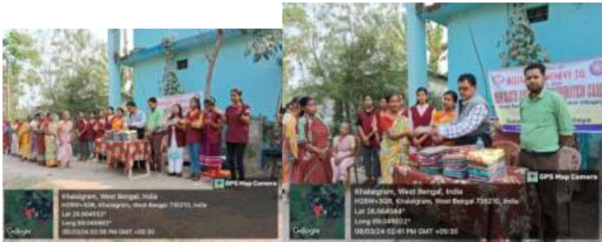
Distribution of Cloths among the villagers of adopted village on the occasion of INTERNATIONAL WOMENS DAY