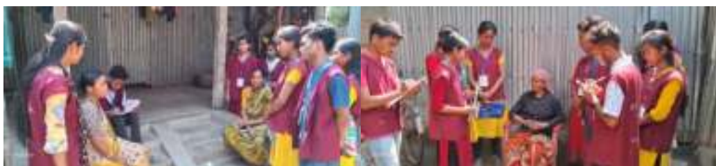
Survey Cum Interaction Programme at Adopted Village