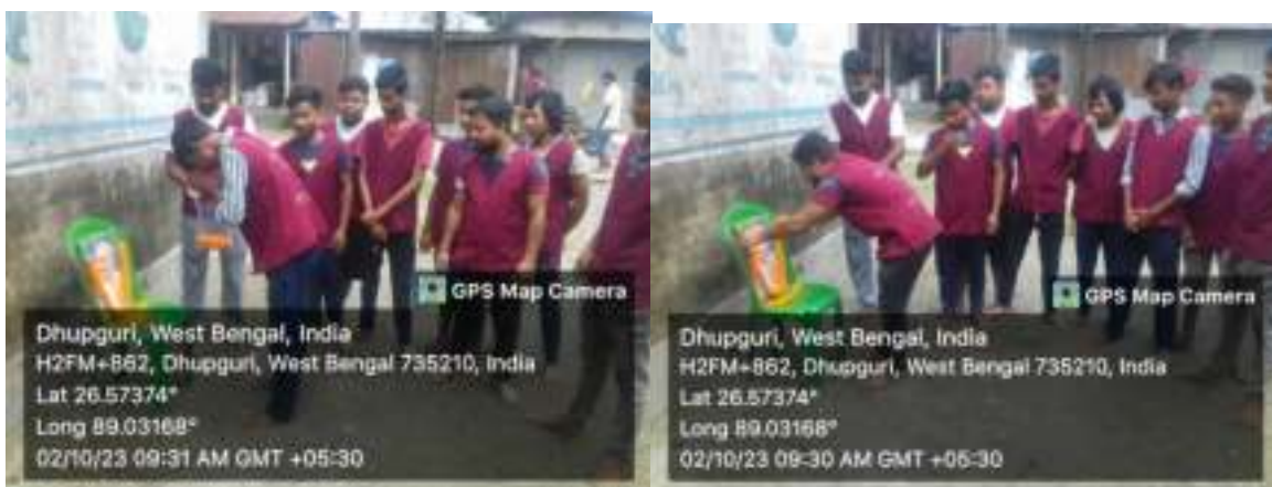
Observation of Birth Anniversary of Ishwar Chandra Vidyasagar

The NSS volunteers of NSS Units of Sukanta Mahavidyalaya, Dhugguri, Jalpaiguri, W.B. today observed Birth Anniversary Mahatma Gandhi. The programme started with garlanding the portrait of Vidyasagar. Programme office delivered speech about the contribution of Mahatma Gandhi to the Nation.