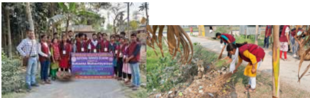
Cleaning Drive: Cleaning of Approach Road from Bamantari to National Highway