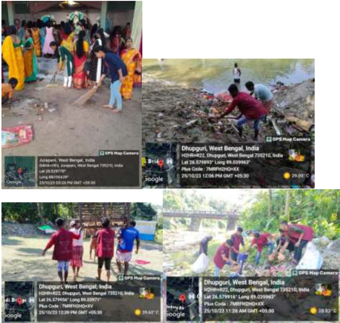
Volunteers participated in cleaning drive under CLEAN INDIA MISSION

On the occasion of Fit India Freedom Run 4.0, N.S.S.Volunteers of Sukanta Mahavidyalaya took part in various activities under the CLEAN INDIA MISSION programme.