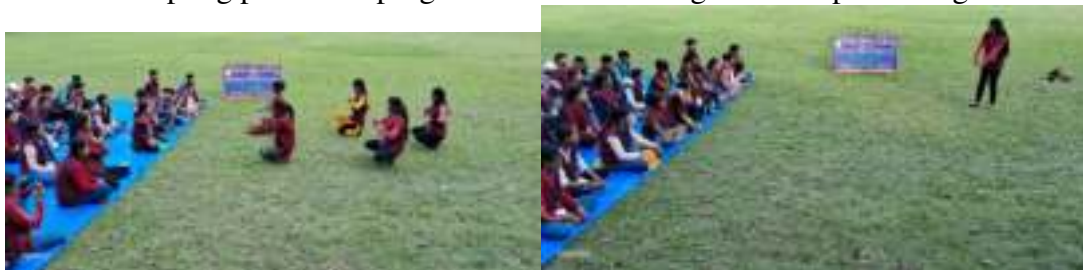
Participation in Cultural Activities