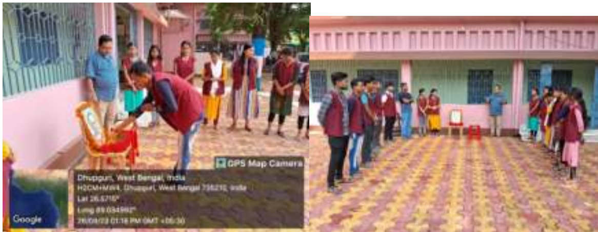
Observation of Birth Anniversary of Ishwar Chandra Vidyasagar

Programme Officers and volunteers of NSS Units of Sukanta Mahavidyalaya, Dhugguri, Jalpaiguri, W.B. today observed Birth Anniversary of Pandit Ishwar Chandra Vidyasagar. The programme started with garlanding the portrait of Vidyasagar. POs delivered speech about the contribution of Vidyasagar in presence of NSS Volunteers.