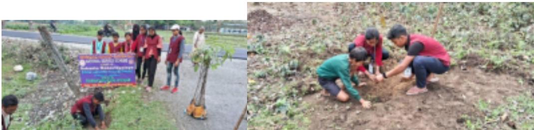
Sapling plantation programme with the villagers of adopted village