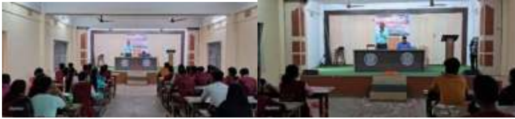
Awareness lecture on BLOOD DONAR MOTIVATION