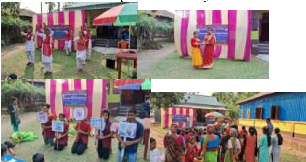
Closing Ceremony: Participation in Cultural Programme