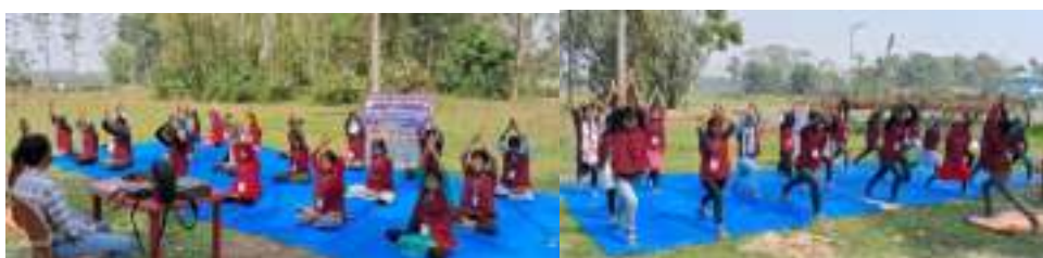
Physical Exercise and Yoga Session