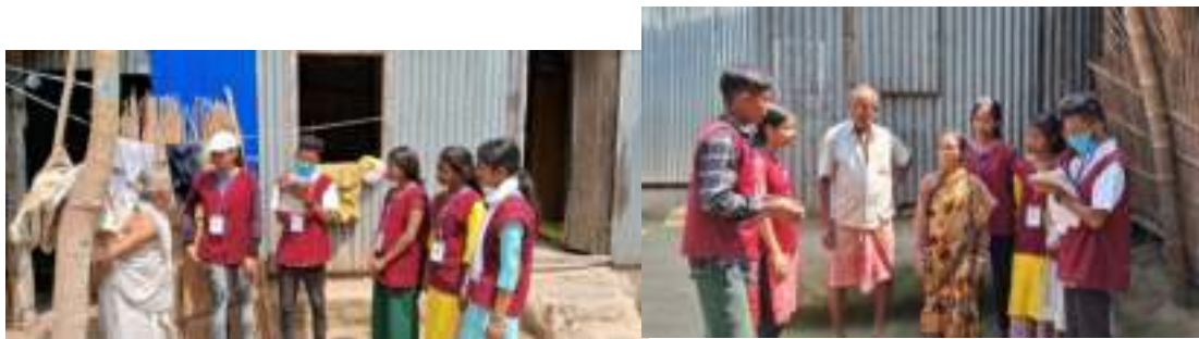
Survey Cum Interaction Programme at Adopted Village