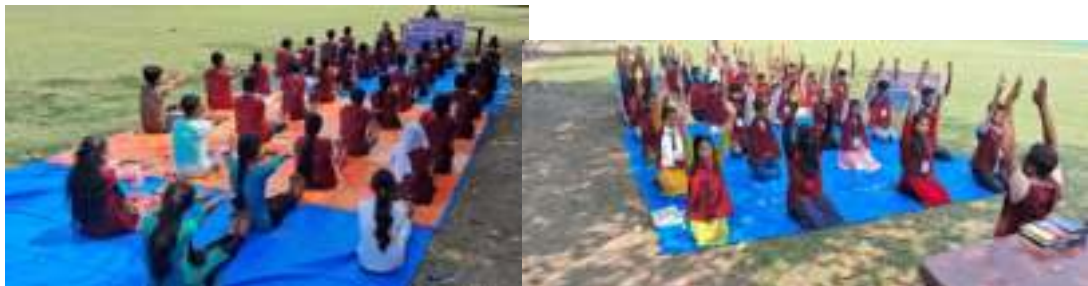
Physical Exercise and Yoga Practice