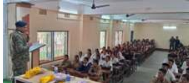
Volunteer participated in "SEMINAR ON AGNIPATH SCHEME"