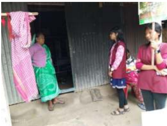
Awareness Campaign: Conservation of Water