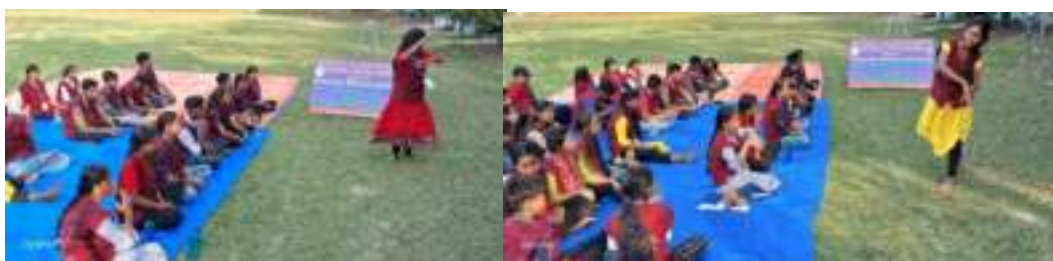
Participation in Cultural Activities