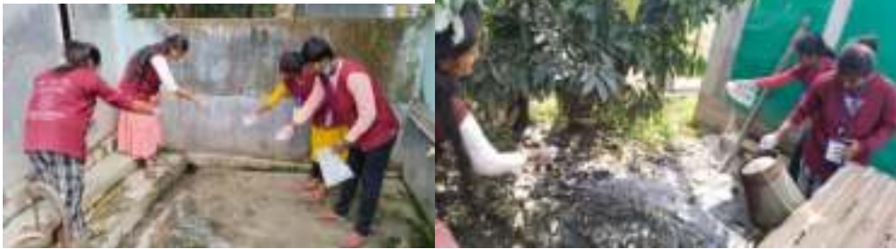
Cleaning Drive: Cleaning and Spreading Bleaching Powder