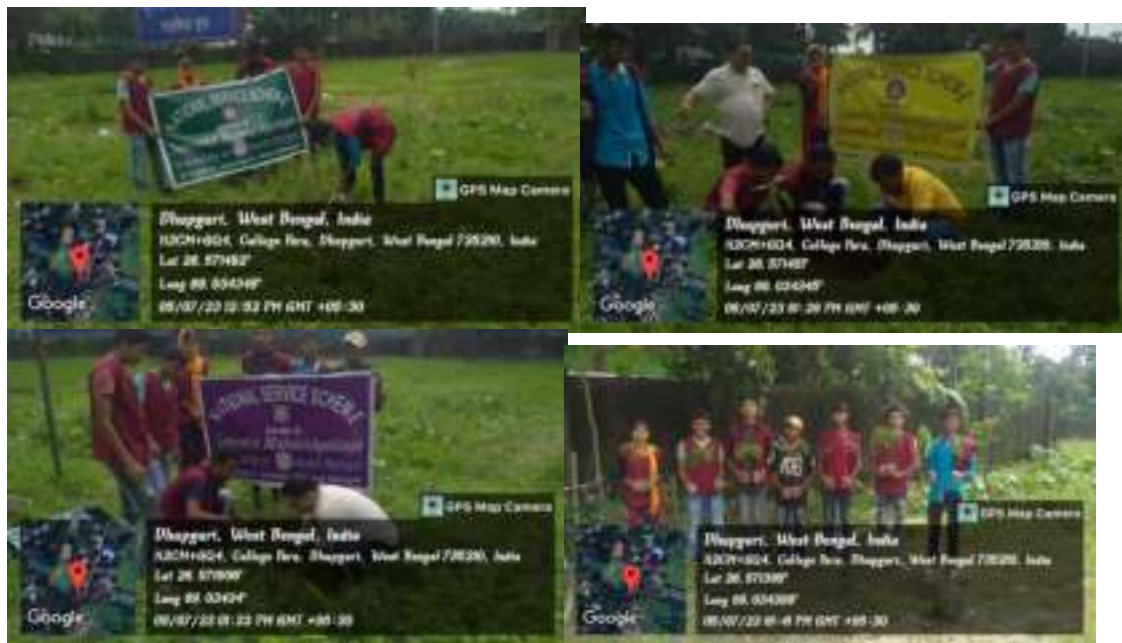
Celebration VON MAHOTSAV (Forest Week)

VANA MAHOTSAV 2023 is celebrated by NSS of Sukanta Mahavidyalaya from 1/07/23 to 07/07/23. As a part of the celebration of Von-Mahotsav, NSS Unit-I,II& III of Sukanta Mahavidyalaya organized plantation drive inside the college campus. Principal, Programme officers, Teachers and NSS Volunteers took part in today's programme.