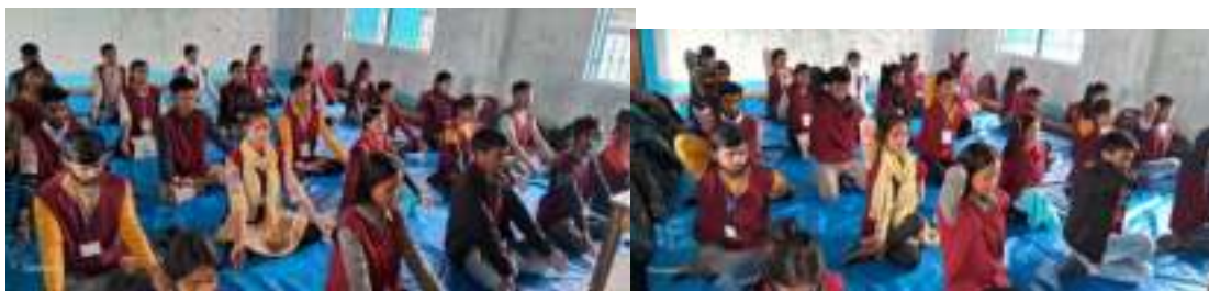
Yoga and Physical Exercise