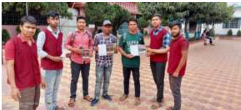
Awareness Rally on AIDS