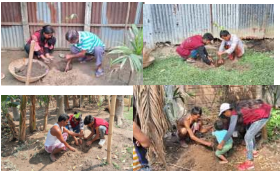
Sapling plantation programme with the villagers of adopted village