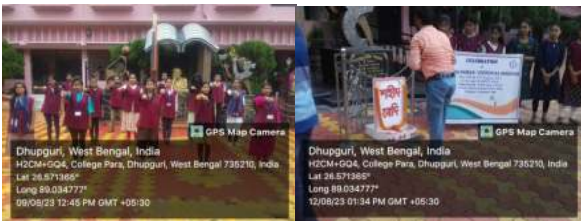
Volunteers taking Oeth on the occasion of Matti Ka Naman- Viron Ka Bandhan