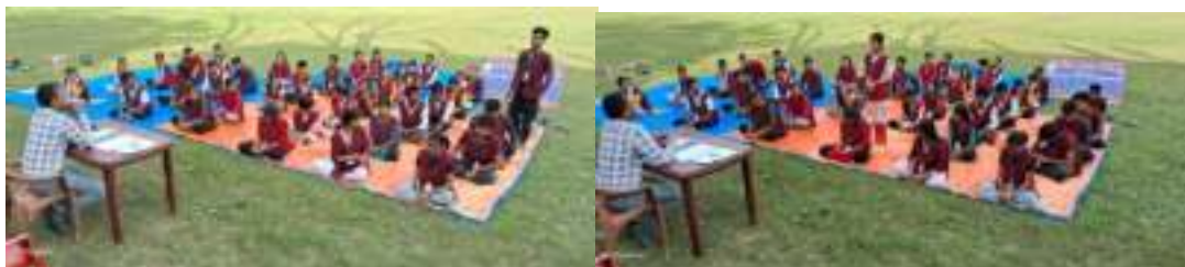
Interaction Session: Introduction of Volunteers