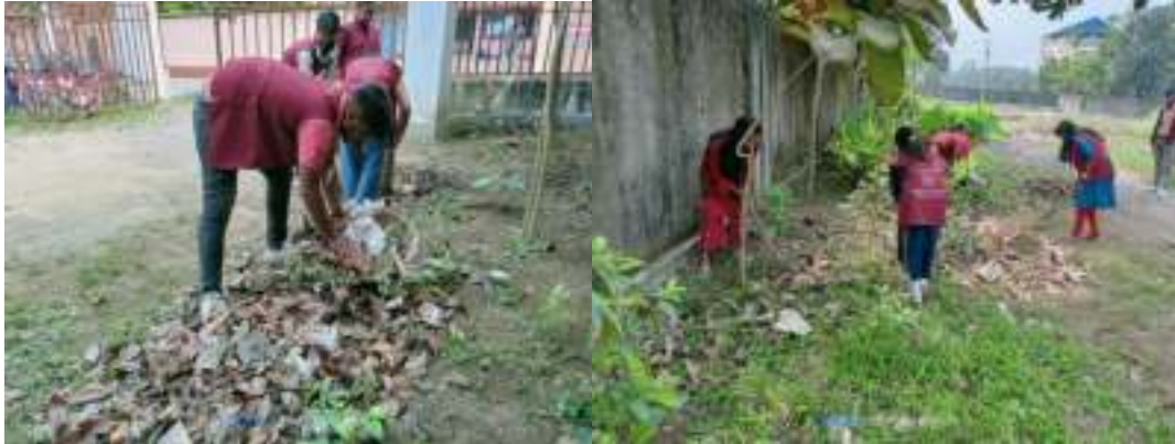
Cleaning drive programme near Gete No. 2 of College Campus