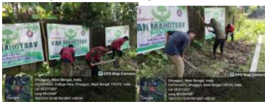
Celebration of Aranya Saptaha 2023(Govt. of West Bengal)

N.S.S. Volunteers of Sukanta Mahavidyalaya, Dhugguri, Jalpaiguri, W.B. rendering voluntary service for preparing betel nut saplings bed for plantation in connection with Aranya Saptaha 2023 of the government of West Bengal.