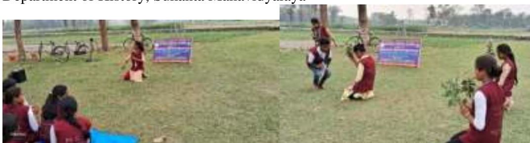
Participation in Cultural Activities