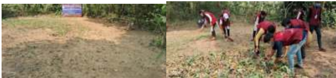
Cleaning Drive: Cleaning of Worship Place (Thakurpath) at Adopted Village