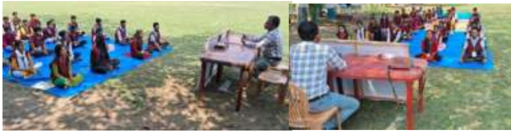
Inauguration and of the Special Camping Programme