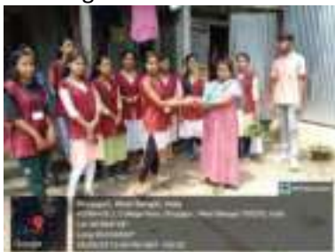
Distribute saplings to our volunteers and families nearby college campus