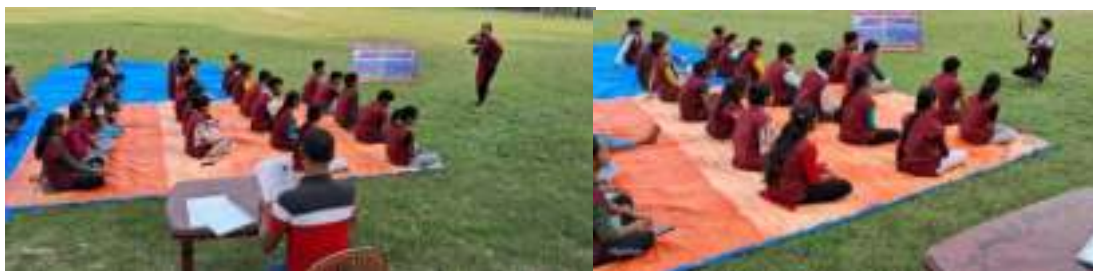
Participation in Various Cultural Activities