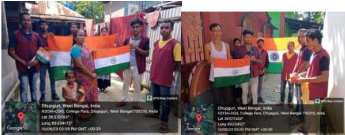
Distribution of National Flag in the Adopted Village

NSS Volunteers of Sukanta Mahavidyalaya, Dhupguri, Jalpaiguri, W.B (Under NBU) with a patriotic manner took part in the campaign of "Har Ghar Tiranga" to celebrate 76th Indian Independence Day which will be celebrated by the entire Nation on 15th August, 2023.