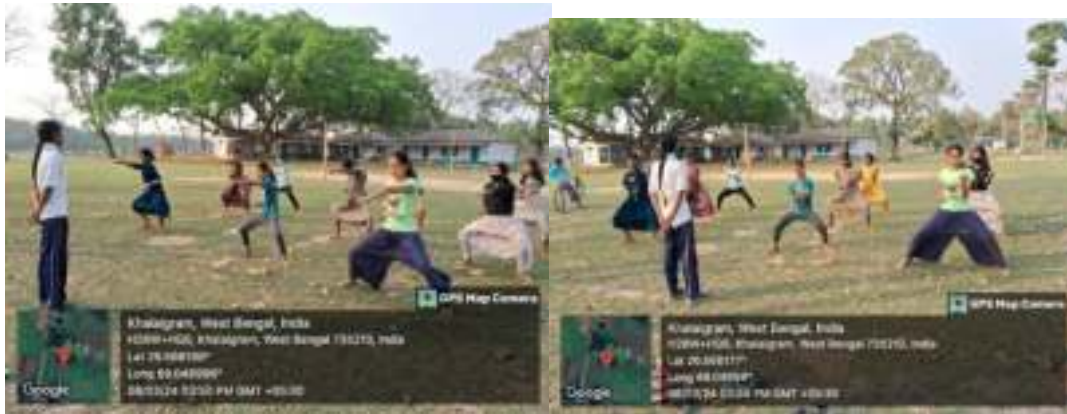
Self Defence Training Programme for the Children of adopted Village