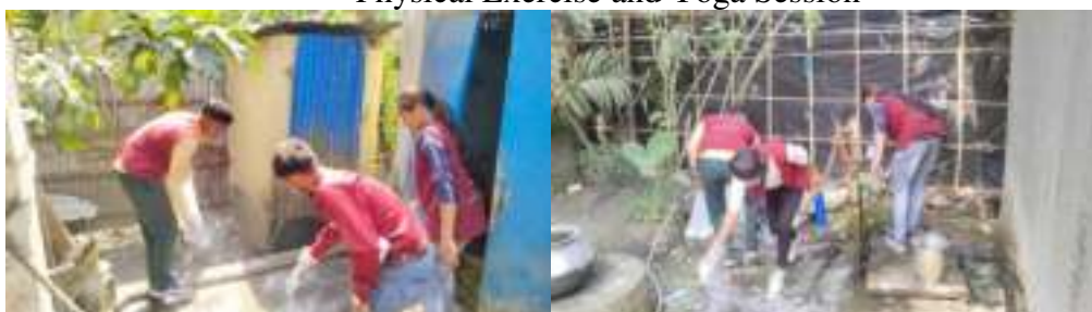
Cleaning Drive: Cleaning and Spreading Bleaching Powder