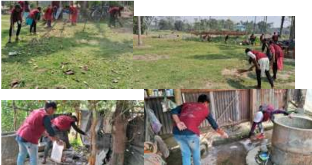
Cleaning and Spreading Bleaching Powder