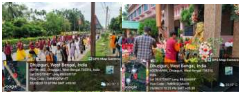
Volunteers took parts in the rally and other activities in the college foundation Day