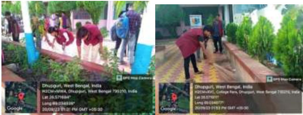
Volunteers took part in Cleaning Drive in College Campus

Under the scheme of SWACHHATA HI SEVA programme N.S.S volunteer participated in the cleaning drive in the college campus.