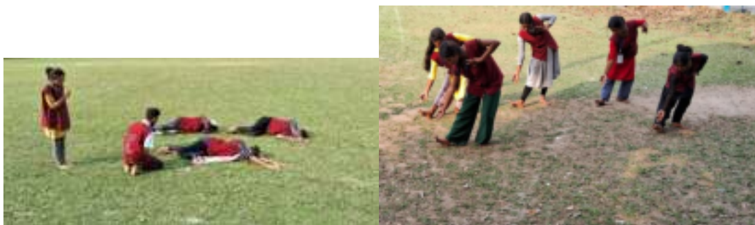
Participation in Cultural Activities