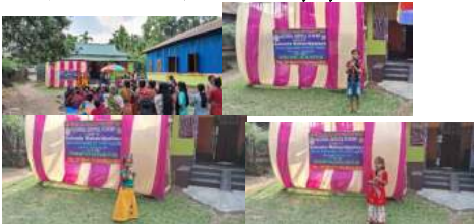
Participation in Cultural Programme