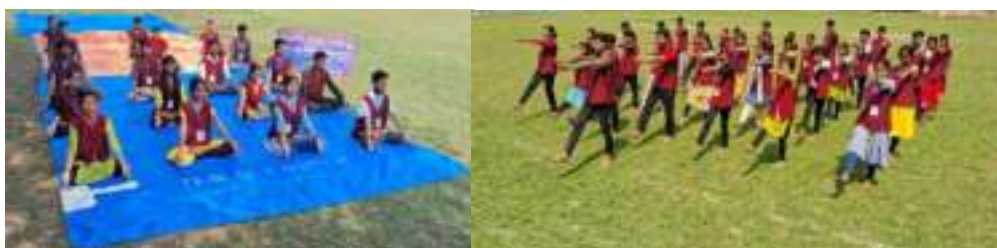
Physical Exercise and Yoga Session