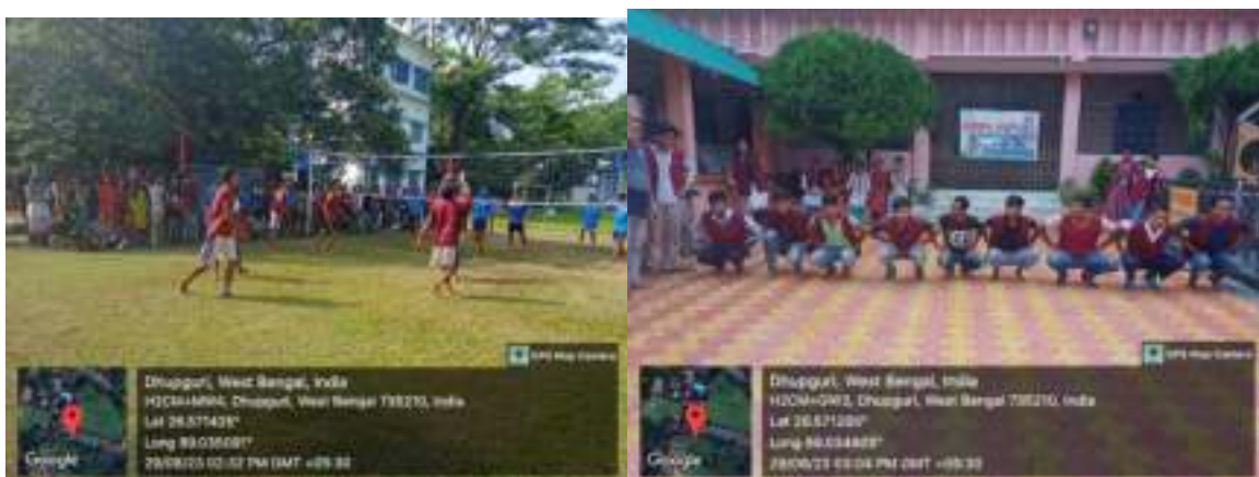
NSS Volunteers took part in various sports activities on Sports Day

On the occasion of National Sports Day 2023, N.S.S.Volunteers of Sukanta Mahavidyalaya, Dhugguri, Jalpaiguri, W. B. celebrate the sports day through participating in various sports events.