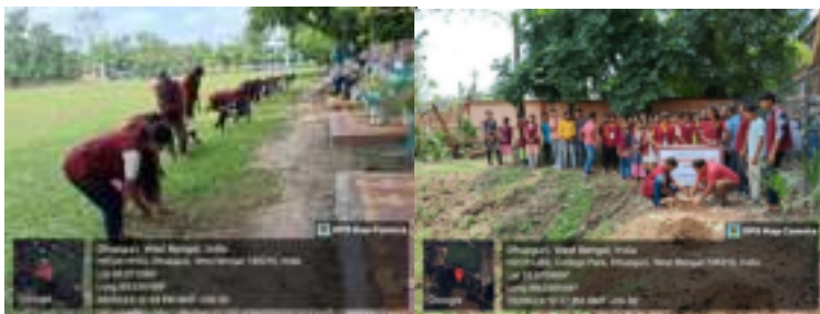
Cleaning Drive Plantation drive in the college campus