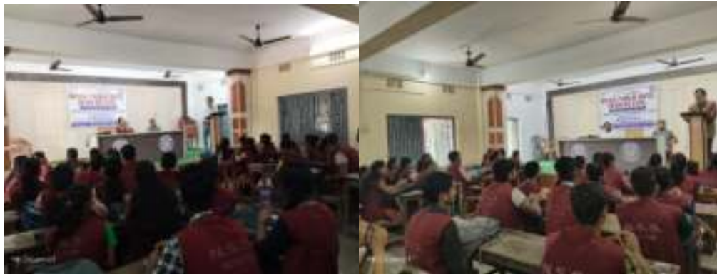
Awareness lecture of “MERA PAHLA VOTE DESH KE LIYE”