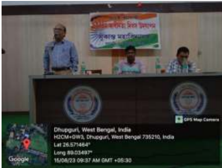
Celebration of Independence Day-2023