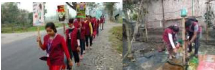
Awareness Rally on WORLD WATER DAYSample Collection for testing Drinking Water