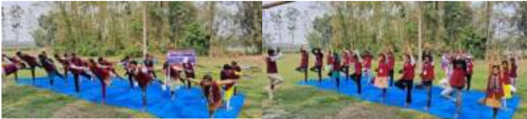
Physical Exercise and Yoga Session